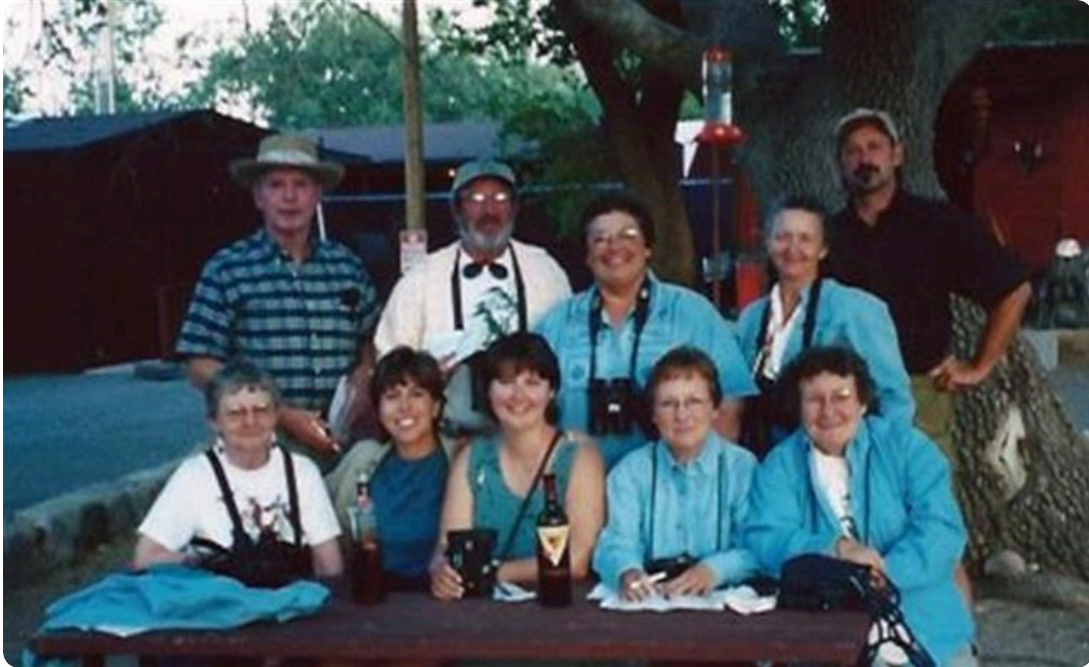
Arizona Birding Trip 2000